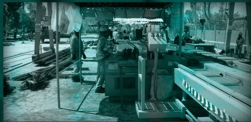
ODEBRECHT - TRIPOLI AIRPORT