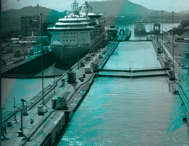
ARMACENTRO - PANAMA CANAL

Visit us at BC India in Mumbai Booth B-19 with our partner JAYPEE February 8-11, 2011.