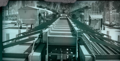
SOCHI 2014 WINTER OLYMPICS