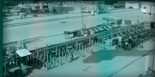
SAUDI OGER - PNU UNIVERSITY