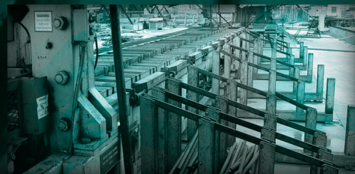
CHINESE NUCLEAR FACILITIES